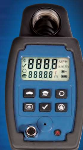
Rear LCD display