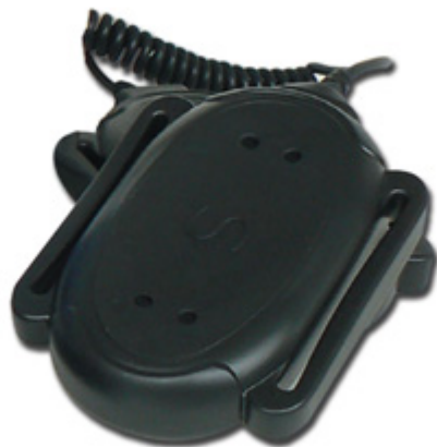
28322 PLATE TRANSDUCER 70X120 mm for MT Plate transducer for GIMA MT BASE PLUS - magnetotherapy (code 28321). Size: 70 x 120 mm