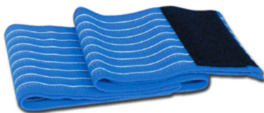
28323 ELASTIC BELT IN PARA RUBBER for MT Velcro elastic band 100 x 8 cm for: - GIMA MT BASE PLUS (code 28321).